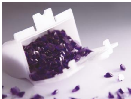
With Resin Case